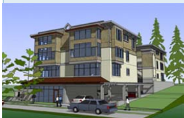
Kingston Marina View

A great amount of care and time have gone into wetland studies and mitigation planning for the project. The mitigation plans have been submitted to the Kitsap County Department of Community Development (DCD) for site work approval. House plans have been completed for the three housing models. Site work to build the roads and install the utilities is anticipated to begin late Spring or mid-year of 2007. Sales of lots are anticipated to begin in the Spring of 2007.