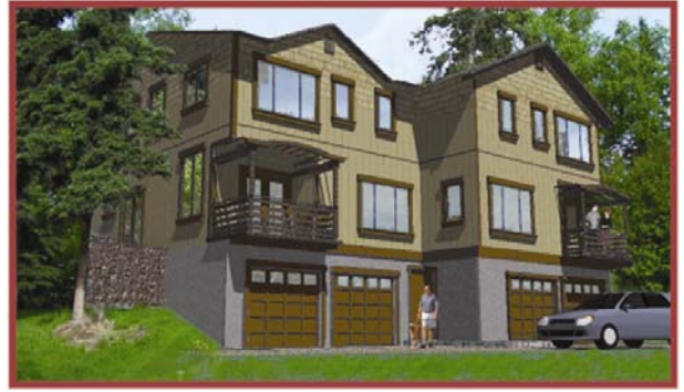
Olympic Silhouette Townhomes

The binding site plan was submitted to the City of Poulsbo in November of 2006 for review. Final arrangements for construction easements are being completed with adjoining property owners. Sale of the project is anticipated in late Spring or early Summer of 2007.