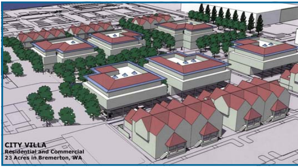
CITY VILLA Residential and Commercial 23 Acres in Bremerton, WA