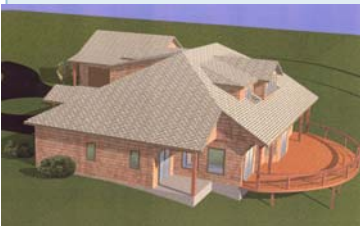
View side of Three Cedars Model at Kingston Ponds

We are encouraged by the support and involvement we are receiving for the City Villa project from both the City of Bremerton and the public at large.